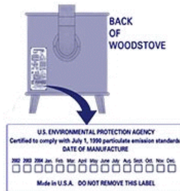
Permanent Wood Stove Label affixed to a stove