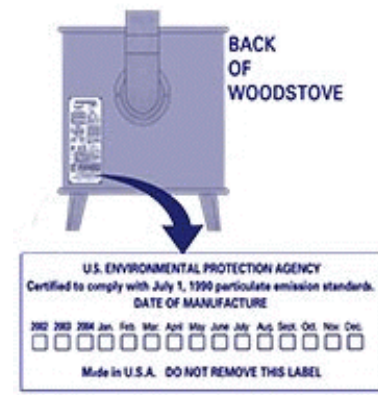
Permanent Wood Stove Label (typically affixed to the back of a stove)