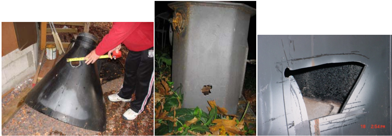
Above are example images of older stoves which have been rendered inoperable by cutting a whole in the firebox.